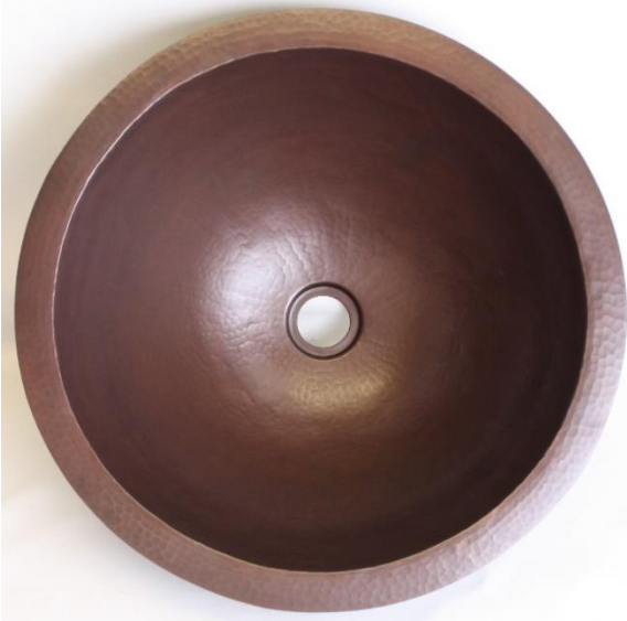
Shown in DB