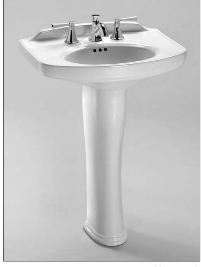
Faucet sold separately